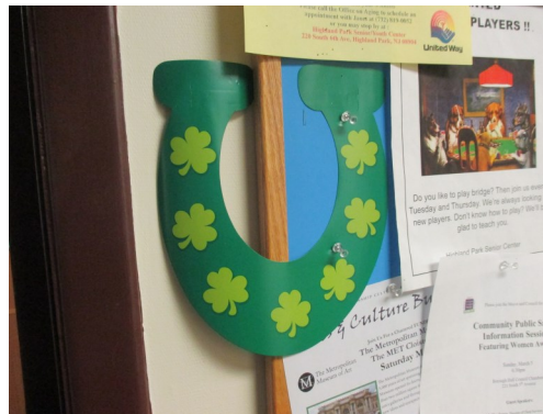
LEPRECHAUNS AND HORSE SHOES.....LUCK OF THE IRISH!