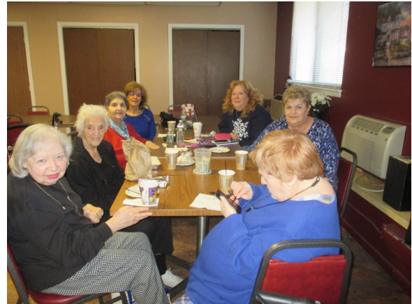
THE HAPPY S.K CAFÉ BUNCH!