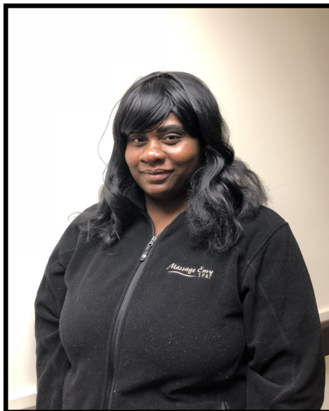
RUTH THOMAS PARK TERRACE, 608 BENNER STREET