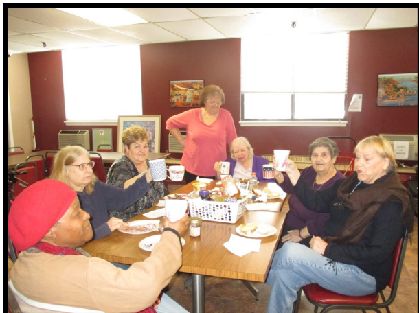
PATTY IS BACK AND THE SK CAFÉ HAS RESUMED!